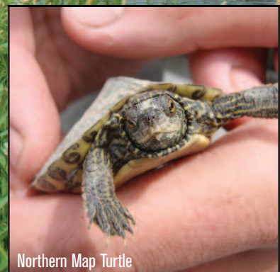
Northern Map Turtle