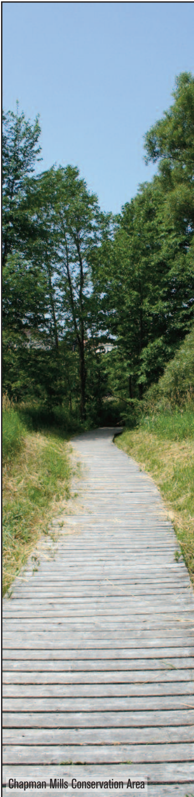
Chapman Mills Conservation Area