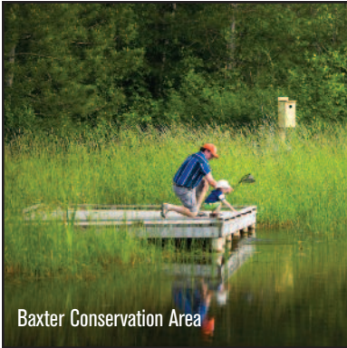
Baxter Conservation Area